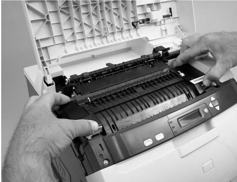
Figure 5-30 Remove the fuser