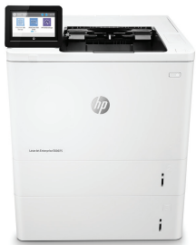
HP LaserJet Managed E60075x