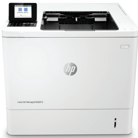
HP LaserJet Managed E60075dn

This HP LaserJet Printer with JetIntelligence combines exceptional performance and energy efficiency with professional-quality documents right when you need them – all while protecting your network from attacks with the industry's deepest security.