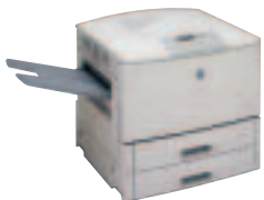
hp LaserJet 9000n printer