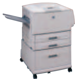
hp LaserJet 9000dn printer with optional 2000-sheet feeder