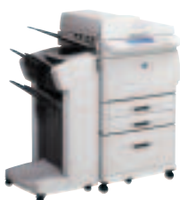
hp LaserJet 9000mfp/9000Lmfp printer with optional stapler/stacker

The HP LaserJet 9000 series is one of a new generation of internet-enabled devices, offering general office users in demanding workgroup environments outstanding high volume performance from a proven reliable platform.