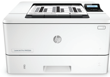
HP LaserJet Pro M402dn

Printing performance and robust security built for how you work. This capable printer finishes jobs faster and delivers comprehensive security to guard against threats. 1 Original HP Toner cartridges with JetIntelligence give you more pages. 2