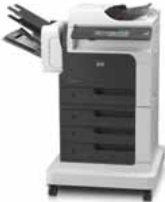
(HP LaserJet Enterprise M4555f MFP)