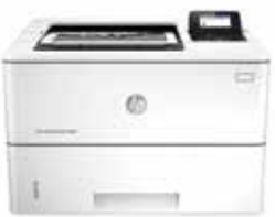
HP LaserJet Enterprise M506dn