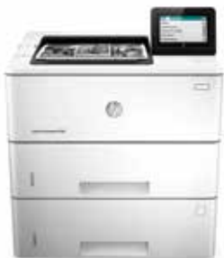
HP LaserJet Enterprise M506x