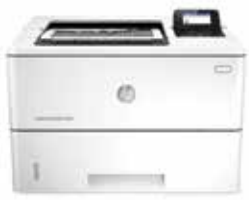
HP LaserJet Enterprise M506n

Finish key tasks faster with a printer that starts right away and helps conserve energy. 1 Multi-level device security helps protect from threats. 6 Original HP Toner cartridges with JetIntelligence and this printer produce more high-quality pages. 2