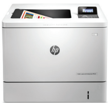
HP Color LaserJet Enterprise M553n

Speed and colour are the perfect pair for your business. That's why this energy-efficient printer and Original HP Toner cartridges with JetIntelligence combine to produce vibrant, professional-quality documents right when employees need them.