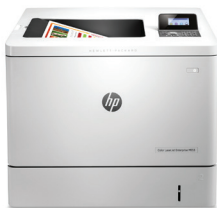
HP Color LaserJet Enterprise M553dn