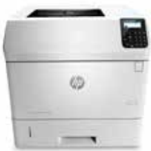
HP LaserJet Enterprise M605n

Accelerate business results with outstanding print quality. Tackle large jobs and equip workgroups for success wherever business leads. 2 Easily manage and expand this impressively fast, versatile printer—and help reduce environmental impact.