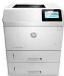
HP LaserJet Enterprise M605x