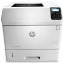
HP LaserJet Enterprise M605dn