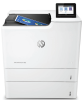
HP Color LaserJet Enterprise M653x