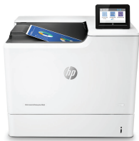
HP Color LaserJet Enterprise M653dn

This HP Color LaserJet Printer with JetIntelligence combines exceptional performance and energy efficiency with professional-quality documents right when you need them—all while protecting your network with the industry's deepest security. 1