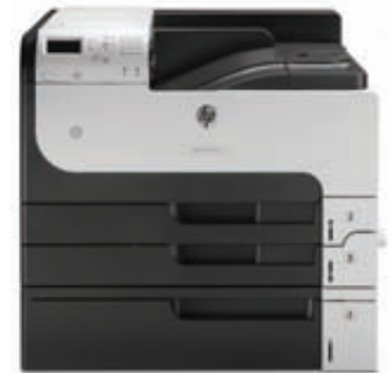
(HP LaserJet Enterprise 700 Printer M712xh)

Mobile printing capability: HP ePrint, Apple AirPrint™