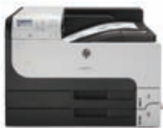
(HP LaserJet Enterprise 700 Printer M712dn)