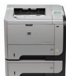
HP LaserJet Enterprise P3015x Printer