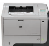
HP LaserJet Enterprise P3015dn Printer