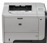
HP LaserJet Enterprise P3015 Printer

Ideal for the IT or department manager in managed office environments, particularly in security-focused businesses, such as legal firms and government agencies, supporting small work teams of 8-10 users that require fast, high quality, output.