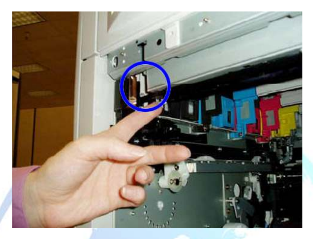
Figure 2: Actuator arm hooked into place

5. If the shutter does not move, check that the actuator arm located on the left side of the shutter is hooked into place, see the figure below.